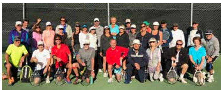
2017 Fall Mixed Doubles Tournament