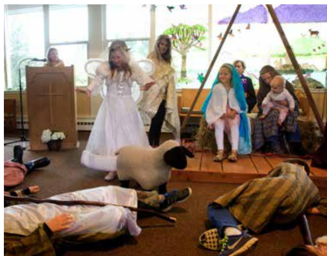
Last year's Youth Christmas Pageant.

Sunday, Dec. 24 at 7:00 p.m. - Candlelit Christmas Eve Service