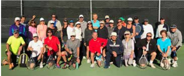
Participants in last year's (2017) Mixed Doubles Tournament