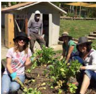
Left: Come feed your soul with the Justice Garden, feeding the hungry!