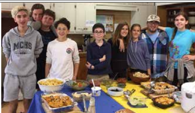
Top: Youth Chefs Cooked the Annual Cinco de Mayo Feast — Chicken Enchiladas!