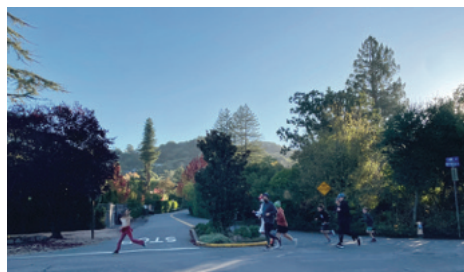
Left: Turkey trotters flew down Butterfield on Thanksgiving morning.

SLEEPY HOLLOW HOLIDAY PARTY: The Annual Sleepy Hollow Holiday Party was a success with close to 200 attendees - one of the best attended holiday parties over the last couple of years! Following tradition, the Swim Team and Tennis Club contributed towards the main courses of prime rib, ham, pork loin and scalloped potatoes. In addition to a banquet of delicious sides and salads neighbors brought to share, a fun, interactive map of Sleepy Hollow was displayed where they could take a photo and pin it on their homes. It was a wonderful evening of catching up with old friends and meeting new neighbors who have lived in The Hollow from a few weeks to 50 years. If you are interested in planning more events for neighbors of all ages please email shhaevents@gmail.com to get involved.