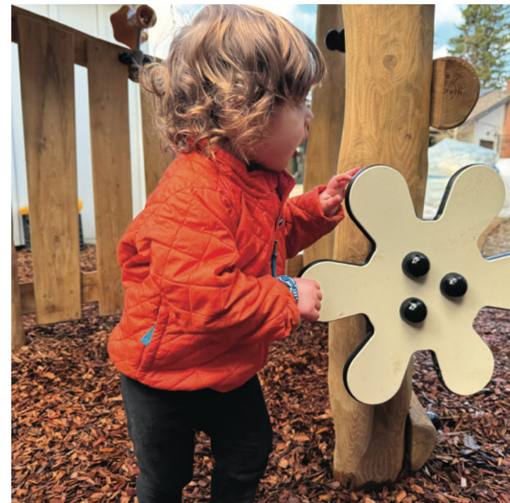
Above & right: The under 5 play area has been completed and is a lovely wooden ship structure which will also include a sand feature for young ones to play.