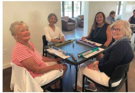
American Style Mah Jong: Thursdays 1:00 – 3:00 p.m.

You can always find the latest upcoming events at: shha.org/UpcomingEvents