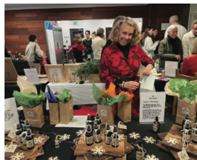
Below, left & right: Over 20 vendors representing local artisans, shops and our own kids sold holiday gifts at the Holiday Fair.