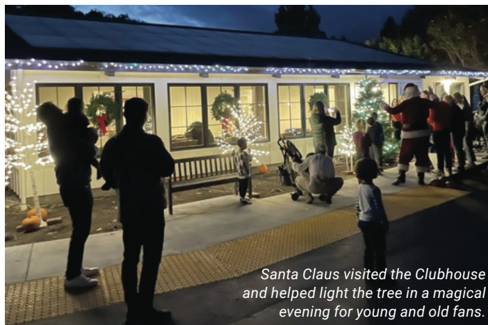
Santa Claus visited the Clubhouse and helped light the tree in a magical evening for young and old fans.