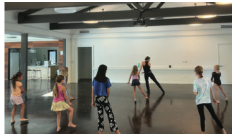
Modern Dance for Youth: 7 week session, Ages 7-10. Wednesdays, 2:15 – 3:30 p.m. Class began in January, prorated pricing is available.