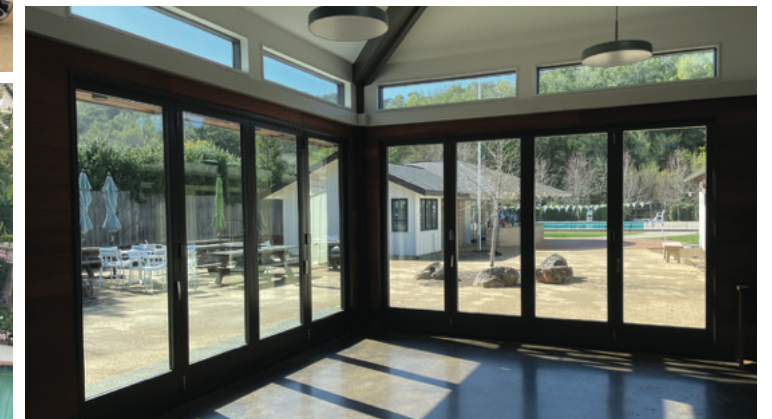
The Community Center is truly the heart of Sleepy Hollow and we are looking for the next manager to lead and execute events for all ages.