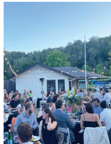
Above Right: Guests enjoy dinner and live auction under the lights & stars