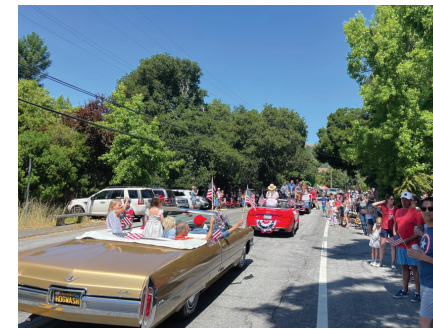
Below Right: Cars in the parade