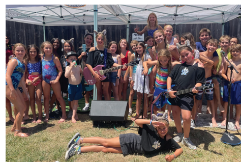
Above: Local youth band WOLF PACK & friends kick off music line up