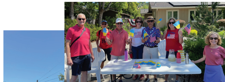
Above: Parade viewers cheering on participants on Butterfield