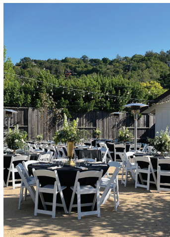
Above Left: The community center walkway was transformed for the evening