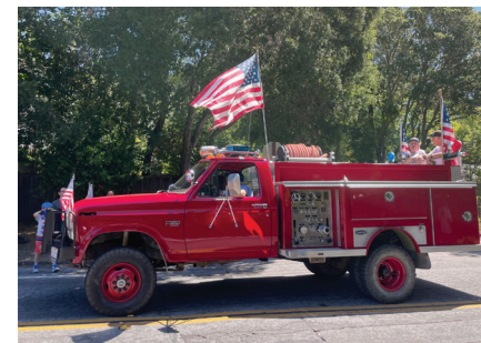
Right: Triple C firetruck keeping us cool & safe