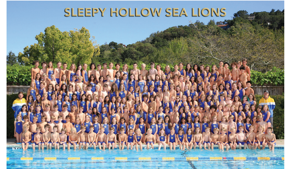
SHHA congratulates the Sleepy Hollow Swim Team on another amazing season.

Contact the pool if you are interested: sleepyhollowpool@gmail.com