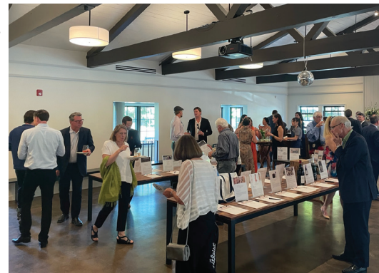
Right: Guests browse & bid at the silent auction