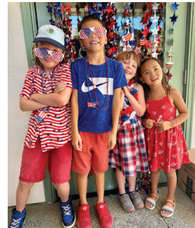
Above: Big cheeses from 4 little ones at the selfie backdrop