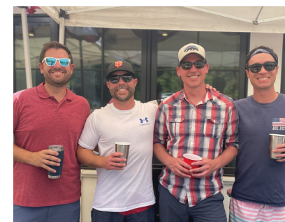
Above: Grill volunteers served 500 burgers & hot dogs