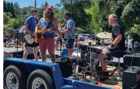
Left: Local band STONEFISH rolled down Butterfield in the parade for the first time, a historic event!