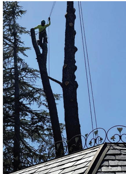
Direct Assistance Program contractors removing a dangerous dead pine that was at risk of falling on a structure.

According to statistics published by the California Department of Forestry and Fire Protection (Cal Fire), as of October 9, 2023, a total of 6,001 fires have burned a total of 317,191 acres. This is below the state's five-year average of 1,509,952 acres burned during the same period. Fortunately Marin has not experienced a large wildfire this season. Nonetheless, it is important for all of us to be wildfire prepared.