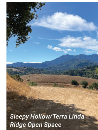
Sleepy Hollow/Terra Linda Ridge Open Space

Having somehow become a member of the Sleepy Hollow long-timers (SHHA member since 1976), I reflect regularly on how the Association has made my life better.