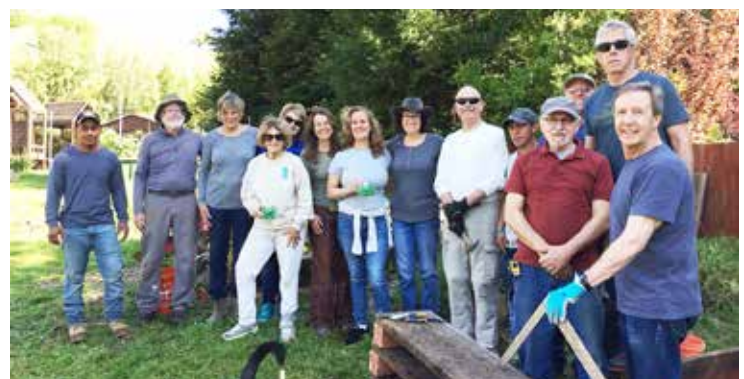
Justice Garden volunteers prepare for a new growing season.