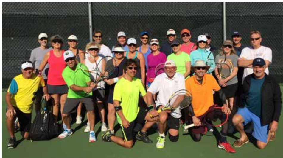
2018 Mixed Doubles Participants

As a driver on this morning, please allow for extra time or plan your commute to miss the bikers. If you are driving between 7:50 and 8:10am, please slow WAY down and give the kids ample space when passing them. Thank you!