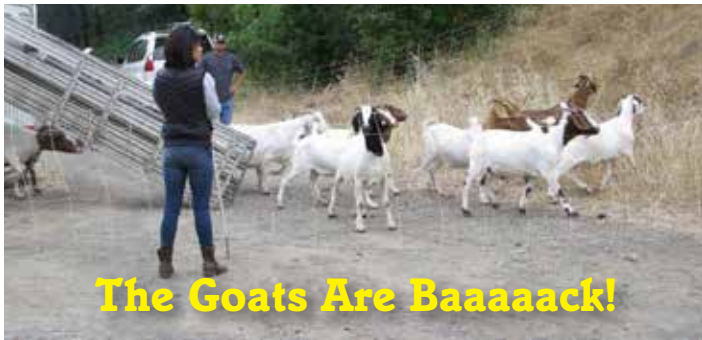
The Goats Are Baaaaack!

By the Sleepy Hollow Fire Protection District