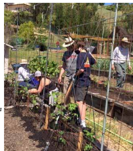
Right: Friends of the Church of all ages turn out for our Annual Tomato Plant Planting Day.