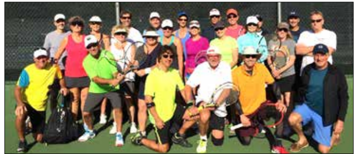
2018 Mixed Doubles Tournament Participants