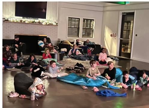
Kids (and parents!) have been enjoying monthly kid movie nights at the clubhouse. Proceeds go to Sleepy Hollow's own Boy Scouts Troop 50. Check our events calendar to sign your kids up for the next movie night on March 18! Pizza dinner now included.