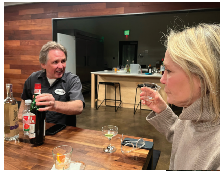
We all learned a lot about mezcal and how it's different from tequila. We got to taste three different mezcal cocktails, plus we sampled a few high-end mezcal and liquors that are based on various kinds of chili peppers. It was a great time!