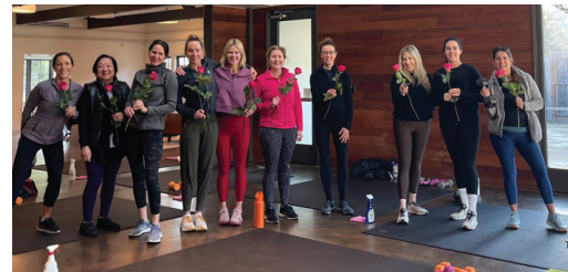
Group Fitness participants for RIPPED, a cardio & strength class taught on Tuesdays, celebrated Valentine's Day with a workout and a rose!