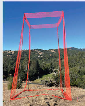
Cell phone tower poles at San Domenico where Verizon has committed to installation this year thanks to tremendous community support and SHHA advocacy.

Apply Here: marincounty.jotform.com/213485939742064