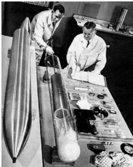
Westinghouse Electric & Manufacturing Company Time Capsule contents, New York World's Fair, 1939